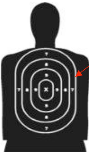
B-27 Target Hits outside the scoring rings are a 0 value